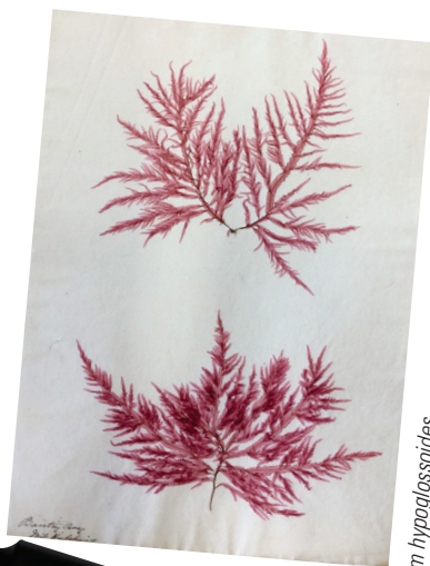
Hypoglossum hypoglossoides

Ferries leave Railway Pier at 11:00am & 1pm (€6.50).